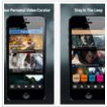
4 Useful Alternatives to iPad YouTube App